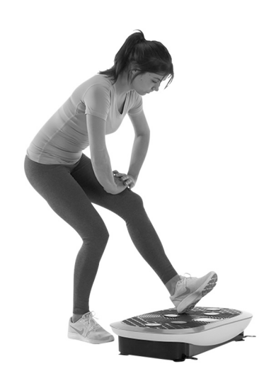
D2 Calf Stretch

Lie down with lower legs on the vibration plate and upper body on the floor. Turning your body in the opposite direction to your knees.