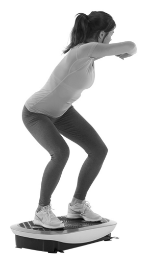
A13 Back Stretch, dynamic