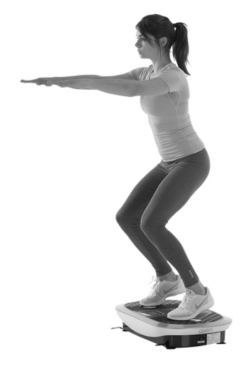
A3 Calf raises, easy