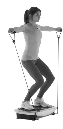
A15 Lateral Shoulder Raise