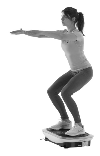
A1 Squats, easy Entire leg muscles

As vibration training hardly involves any cardiovascular activity, we recommend that you also take some cardiovascular exercise in addition to your vibration training.