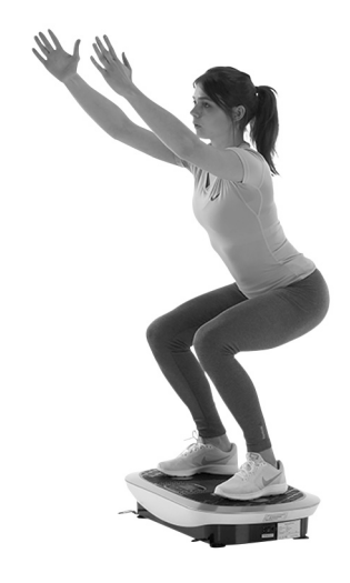
A2 Squats, difficult Entire leg muscles