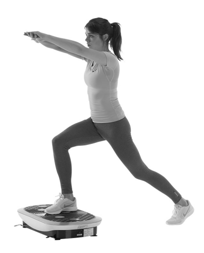
A5 Lunge, one-legged