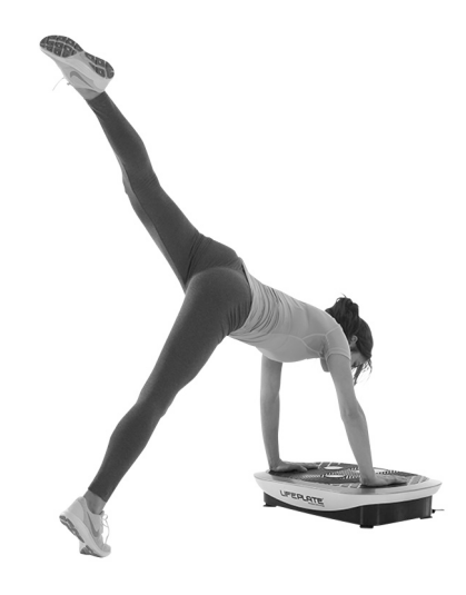
A23 Combination Exercise I