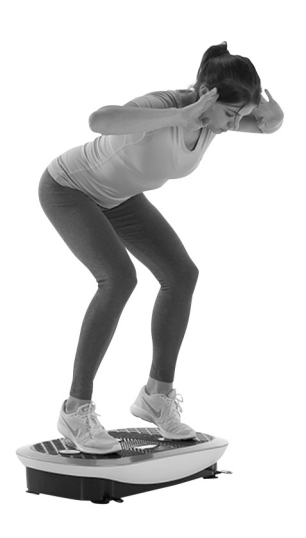
A12 Back Stretch