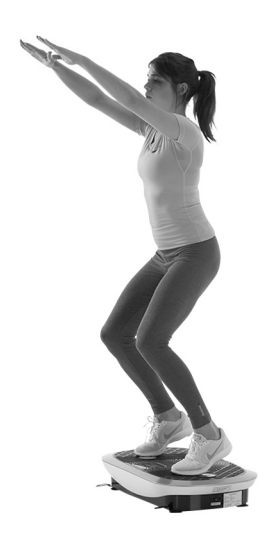
A4 Calf raises, difficult