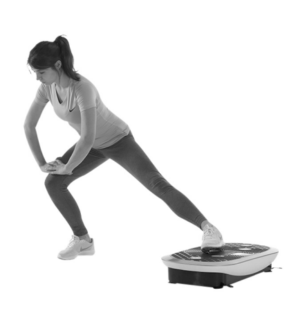
D3 Adductor Stretch

Step lightly on the device with one foot and other foot on the floor. Both legs slightly bent, and feet pointing forwards, push down on backs of your heels and lean gently forwards with your weight.