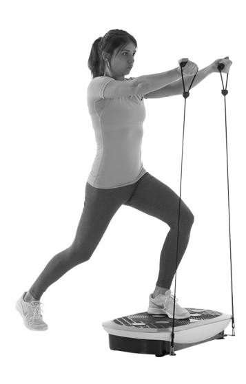
A24 Combination Exercise II Entire body

Facing down with hands on device shoulder-width apart. Arms straight, feet behind together on the floor. Bottom raised above head height. Alternately raise and lower left and right legs straight up behind you.