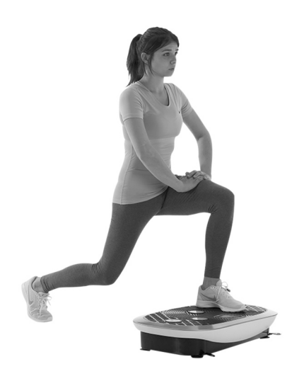
D6 Thigh Stretch

Sit on the device, legs relaxed and bent with heels on the floor. Take hold around your ankles and gently pull your upper body forwards in a gentle stretch.