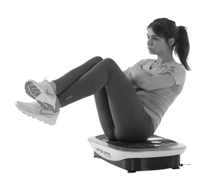
A6 Sit-Up, leicht