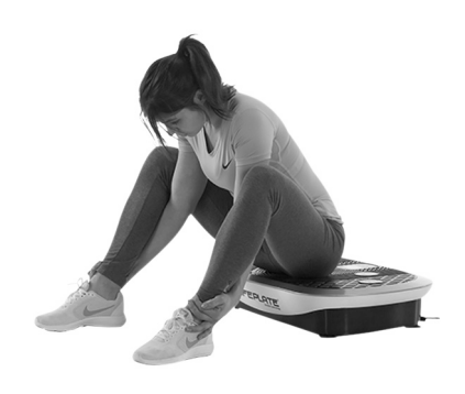
D5 Lower Back Stretch

Kneel in front of the vibration plate. Place hands with stretched out arms in front onto the plate. Stretch your bottom backwards whilst pressing your shoulders down in a gentle stretch along the length of your back.